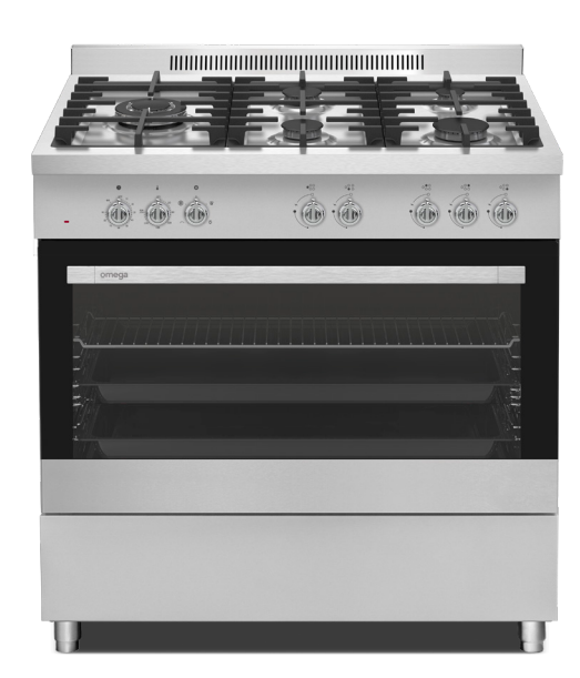
Exclusive to commercial projects